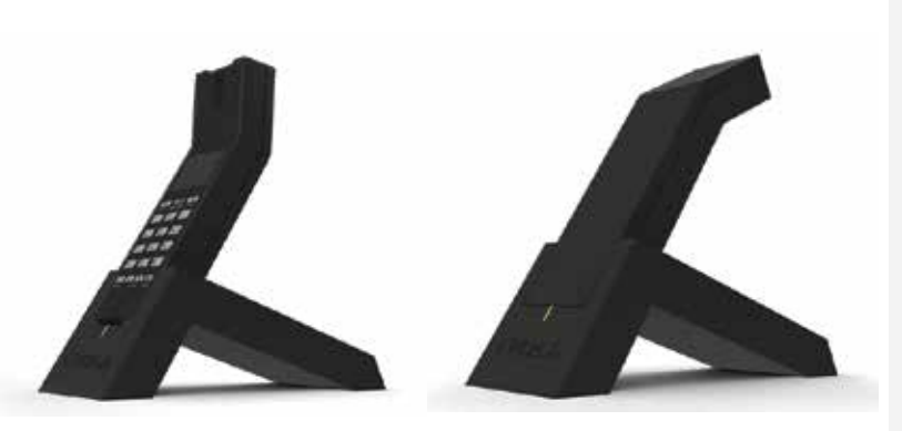
Matching trimline available.

Supports multiple front/back facing RediDock remote handset kits.